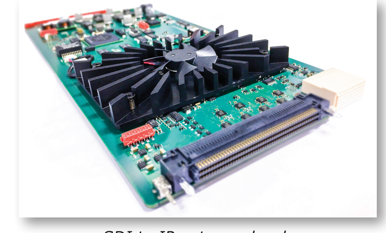
SDI to IP gateway hardware