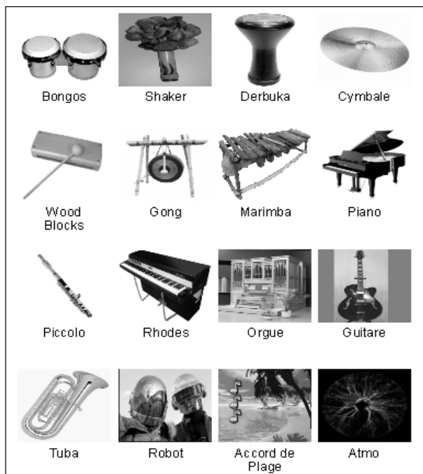
Figure 3. MIDI page of the instrument booklet

Unlike the first experiment, our system is given the exact same status as the usual instruments. This way we could see whether the children would still use the Wiimote system or revert to the standard instruments. Also, restricting the patients to only one instrument prevents them from being overwhelmed by the excitement induced by too large a choice.